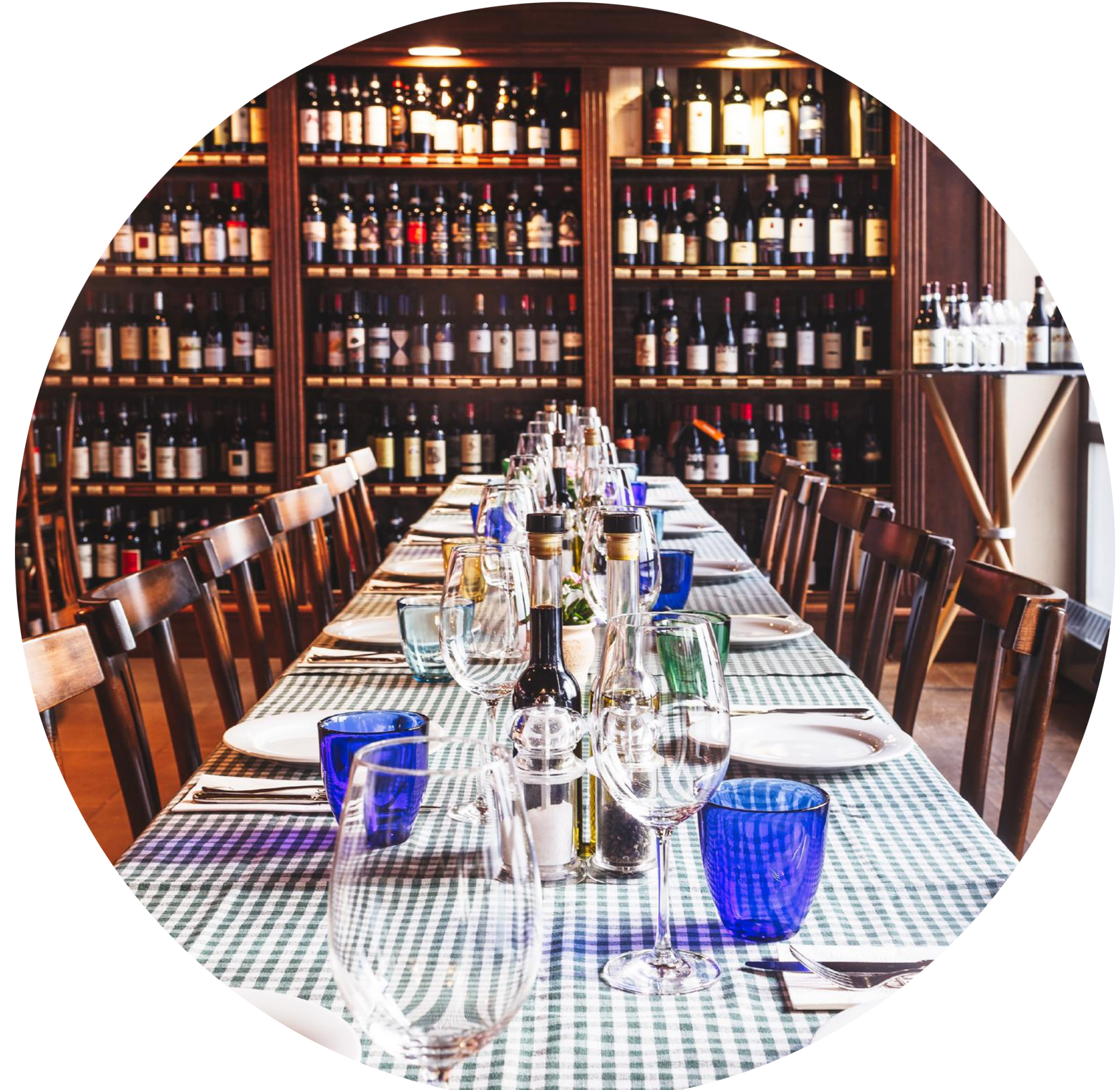
BACK AREA OF THE BISTRO