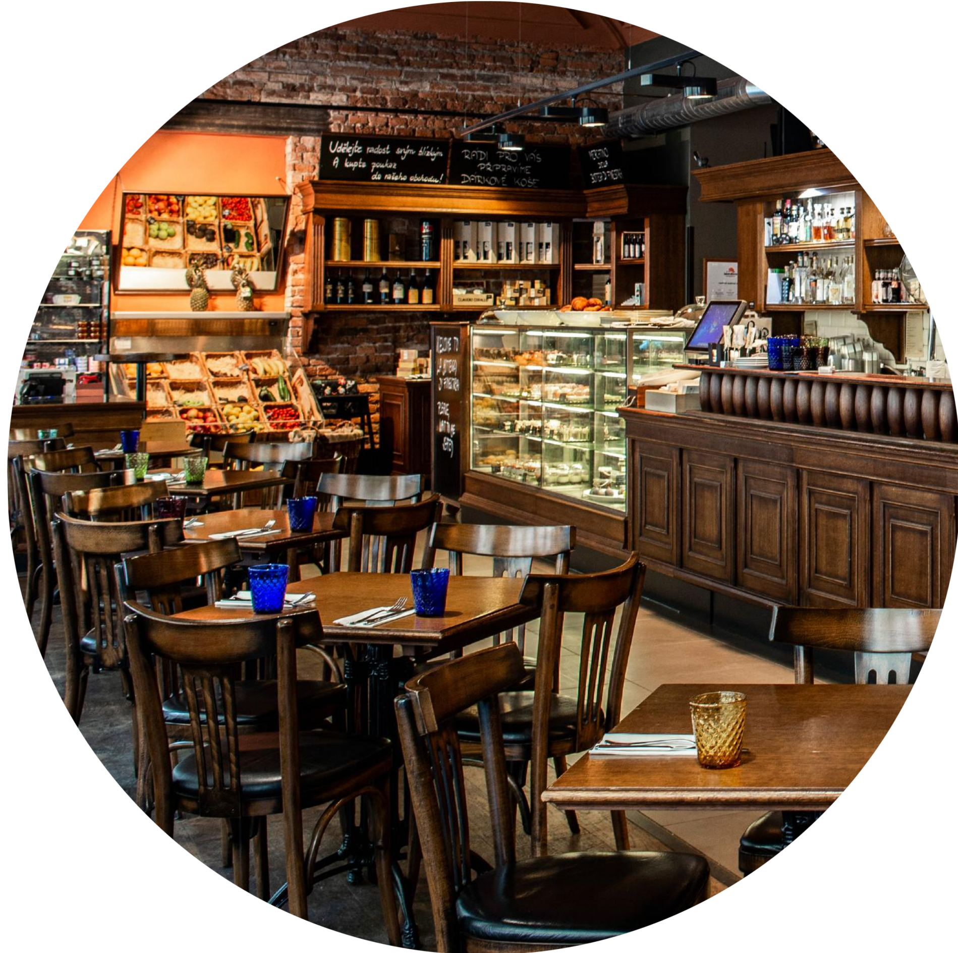
FRONT AREA OF THE BISTRO